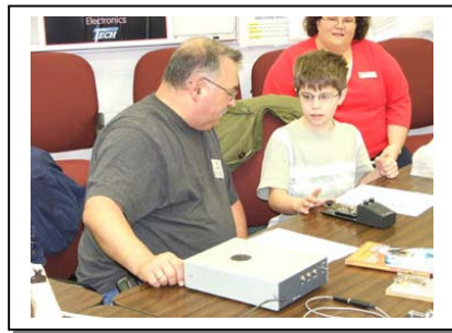
KD5ZOZ helps a future ham

One way that the hams participated was to help visitors send Morse code. Each person would send the international distress code of S.O.S. and then tap out their name on portable keyers. After this was accomplished, they would have a special ticket punched that would allow them to enter into a drawing that the school was having later.